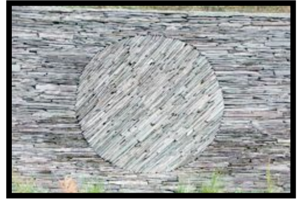
Sheepfold M187, Andy Goldsworthy

Older students are learning vocal techniques in 'Singing in the Studio', exploring street art, creating prehistoric beasts, developing teamwork in 'Creation