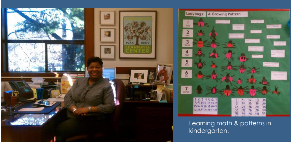
Learning math & patterns in kindergarten.