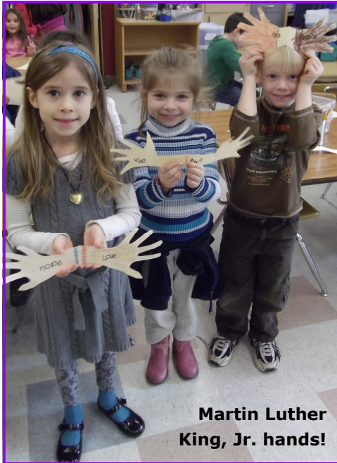
Martin Luther King, Jr. hands!