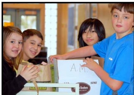
Four of Ms. Stro's students are shown collecting food for the annual Project Second Wind Food Drive. We collected 1,256 pounds of food!