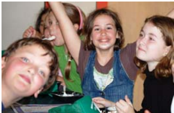
Kelso Celebration page 2