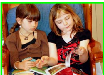
Read with a partner

A student can "read to self"—you read to yourself quietly and you collect interesting words that are new ( look at the picture above ), you can read to someone—you get a partner, a book, and you each read a page and ask questions of your partner ( look at picture below ).