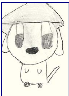
Student Art Gallery page 2

The University of Portland students were awesome last Wednesday night. They taught us all about bones, earthquakes, and germs that are on our hands even after we