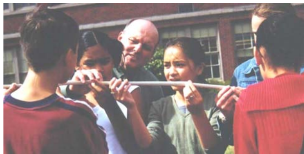
Hands-on learning is an important aspect in every class. Direct observation and cooperative experiments inform lab reports all students create.

Da Vinci cultivates a responsible, cooperative learning community of students and adults encouraging each member to feel comfortable sharing their creative best. Students are expected to behave in a respectful manner towards themselves, their peers and adults.