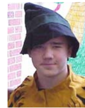
Each student is a unique individual.

STUDENT BODY We serve about 350 students, (approximately 117 at each grade level). This year our student body mix is approximately 37% boys & 63% girls, with 19% minority students including African-Americans, Hispanics, Native Americans and Asian-Pacific Islanders.