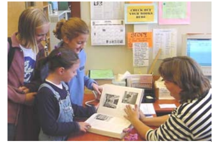
Our library is smaller than most middle schools, and ably run by parent volunteers.

Da Vinci depends on an active parent community to function at its best. Parents organize and maintain all aspects of the school library, help in classrooms, tutor students, sponsor family evenings, lend critical support to student performances, serve on the site council, organize after school and lunch time clubs, classes & teams, take charge of fund raising and many other invaluable tasks.