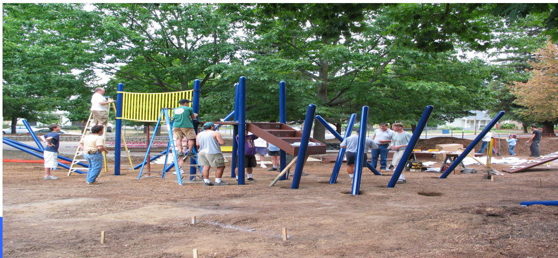
Building a Playground at Sabin— Summer 2004