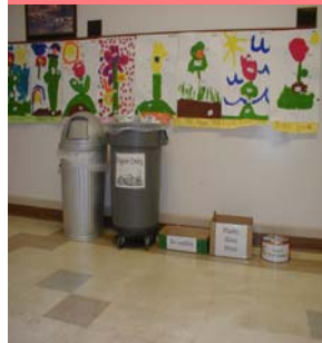
Demonstration Recycling Stations for the clean out.

stream is a high priority for our schools and if you have any questions feel free to contact us.